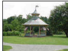
Gazebo in the Borough Park